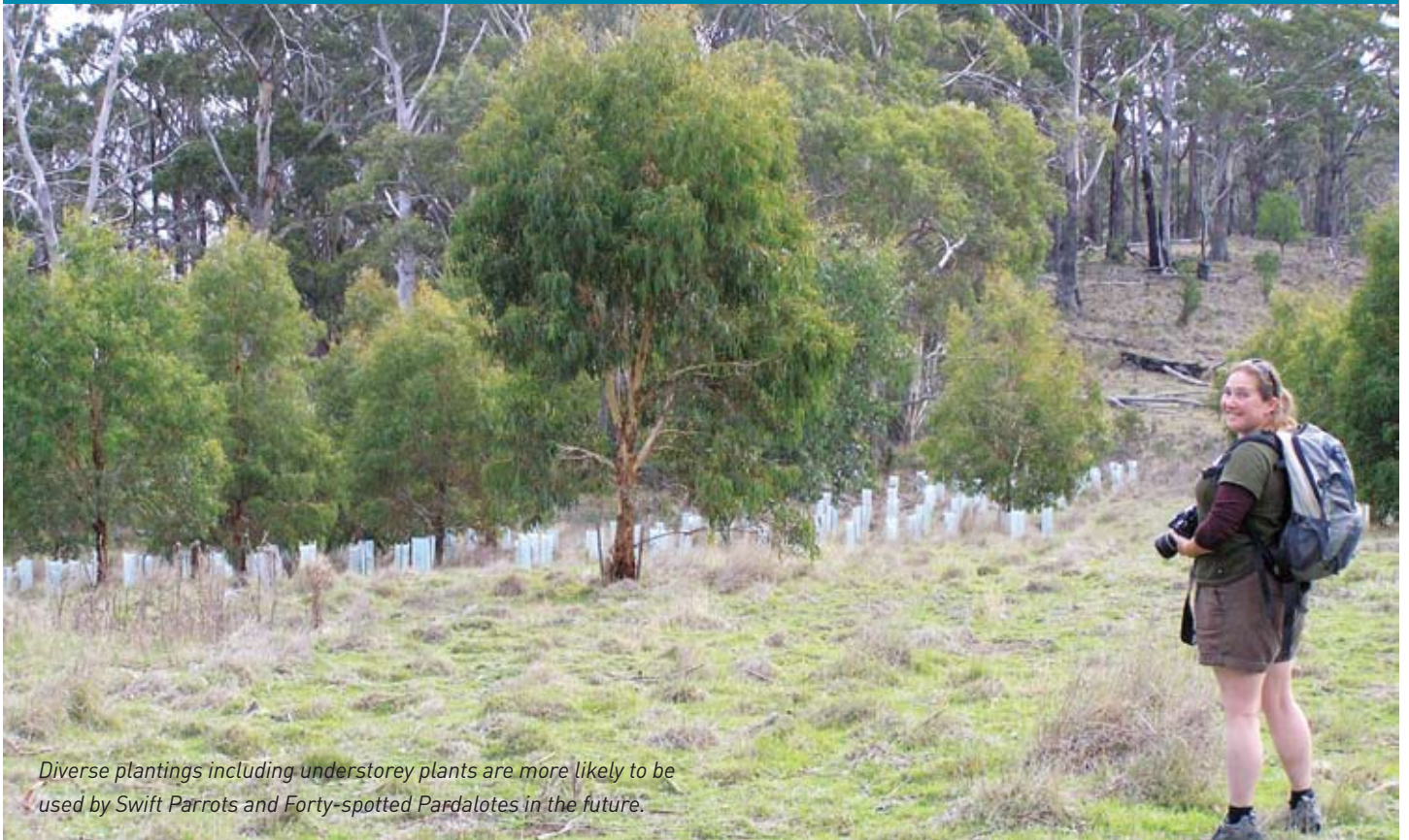
Diverse plantings including understorey plants are more likely to be used by Swift Parrots and Forty-spotted Pardalotes in the future.