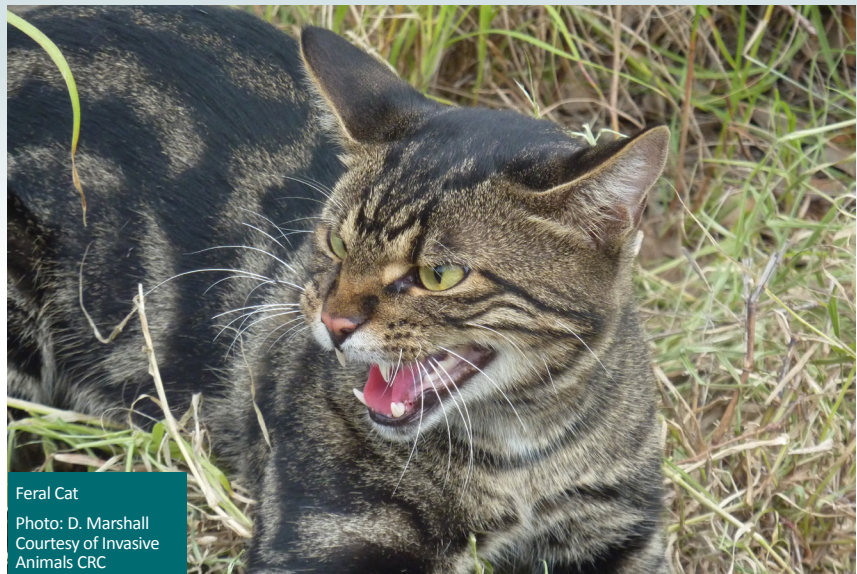
Feral Cat

Currently Tasmania is free from many invasive species that, on mainland Australia, damage crops, spread disease, threaten the survival of native animals and disturb ecosystems. Without community action, the situation in Tasmania could change rapidly and we need to be vigilant and prepared to rapidly respond to the threat posed by new and emerging invasive species. We also need to work together to manage the impacts of invasive species already established in Tasmania.