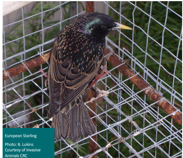
European Starling

Released in the 1880s to control insect pests eating European and pasture plants, the European starling is now so common in Tasmania it is hardly noticed any more.