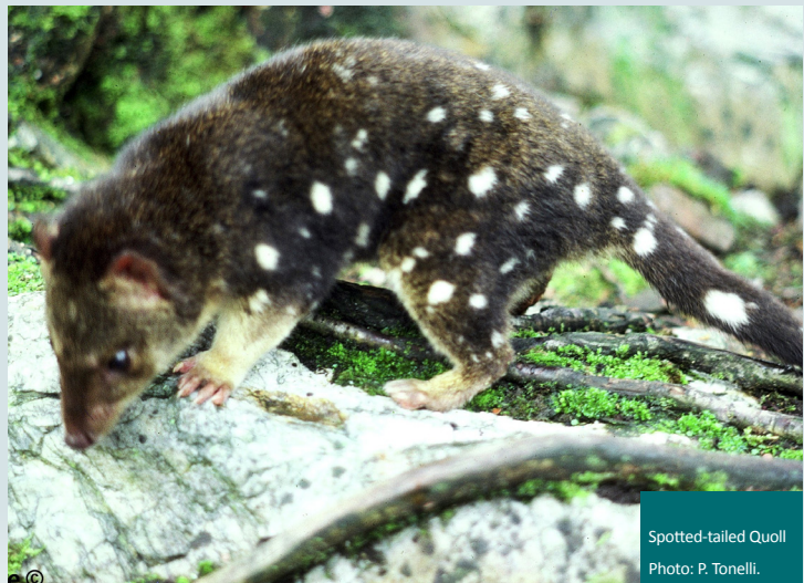
Spotted-tailed Quoll

This species is under threat from loss of habitat, persecution, roadkill and competition from other predators such as cats, dogs and foxes should they become fully established.