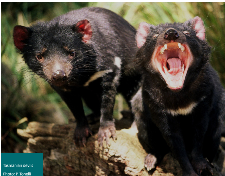
Tasmanian devils

Landholders can play their part in protecting the devil through slowing down on the roads at night, removing dead wildlife from roads where safe to do so and ensuring domestic fowl are in devil and quoll-proof chook pens. Devils will use fallen logs and occasionally wombat burrows as den sites, so it is recommended any potential sites be retained on your property.