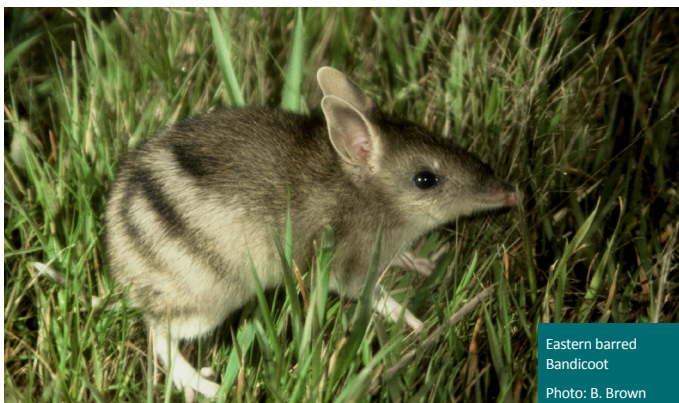
Eastern barred Bandicoot

Virtually extinct in the wild on mainland Australia, there is still a functioning population in Tasmania.