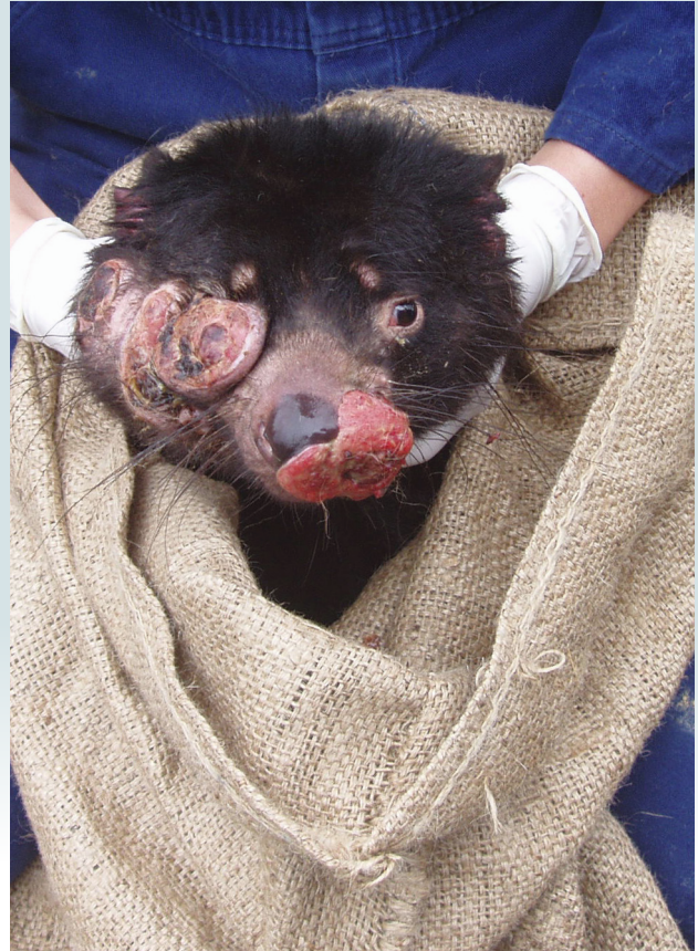
Devil infected with DFTD

Predominantly a scavenger, the devil is also a capable hunter, with its main diet composed of living and dead wallabies, various small mammals and birds along with carcasses of farm animals. With extremely powerful jaws and teeth, the devil will devour entire carcasses including the bones, skin and fur. DPIPW have carried out quite a bit of diet analysis around the State recently and have found that Brushtail Possums are one of their favourite prey species.