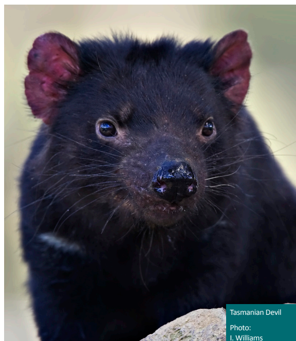
Tasmanian Devil

Where the disease has been prevalent for some years (particularly east coast area), the populations have been reduced by up to 95%. The lower number of devils and the resulting higher levels of carrion in the landscape allow other introduced carnivores (cats, dogs and potentially foxes) to flourish at the expense of native species.