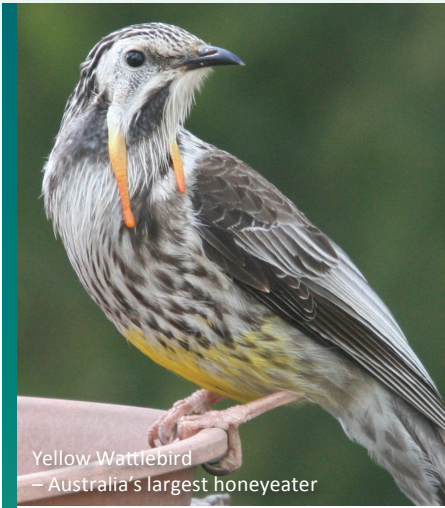
Yellow Wattlebird – Australia's largest honeyeater