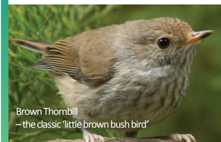
Brown Thornbill – the classic 'little brown bush bird'