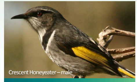
Crescent Honeyeater – male