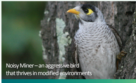
Noisy Miner – an aggressive bird that thrives in modified environments