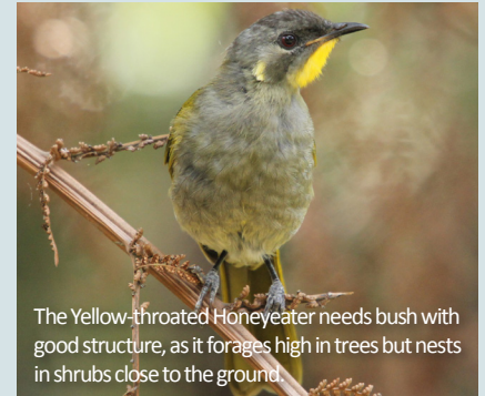
The Yellow-throated Honeyeater needs bush with good structure, as it forages high in trees but nests in shrubs close to the ground.

Some species live in the same bush all year, whilst others migrate in the late autumn to increase their foraging range, descend in altitude or cross Bass Strait to spend their winter on mainland Australia. Bush habitat also supports birds of prey, water birds in creeks and wetlands, and a small number of other species using heaths or grasslands on the forest fringe.