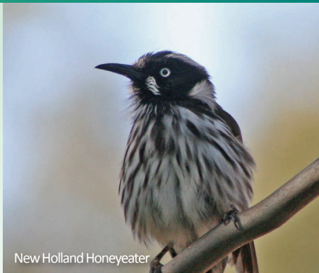
New Holland Honeyeater