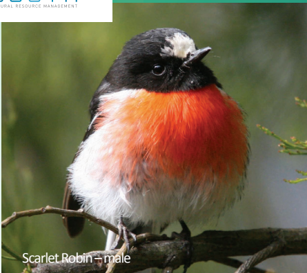
Scarlet Robin – male