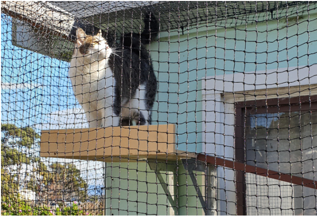
Community members from the Men's shed in Alonnah building a cat enclosure.

There are currently 63 confirmed domestic pet cats living across 43 households on Bruny Island. All of these households were contacted last financial year and 86% have registered their cats with Kingborough Council.