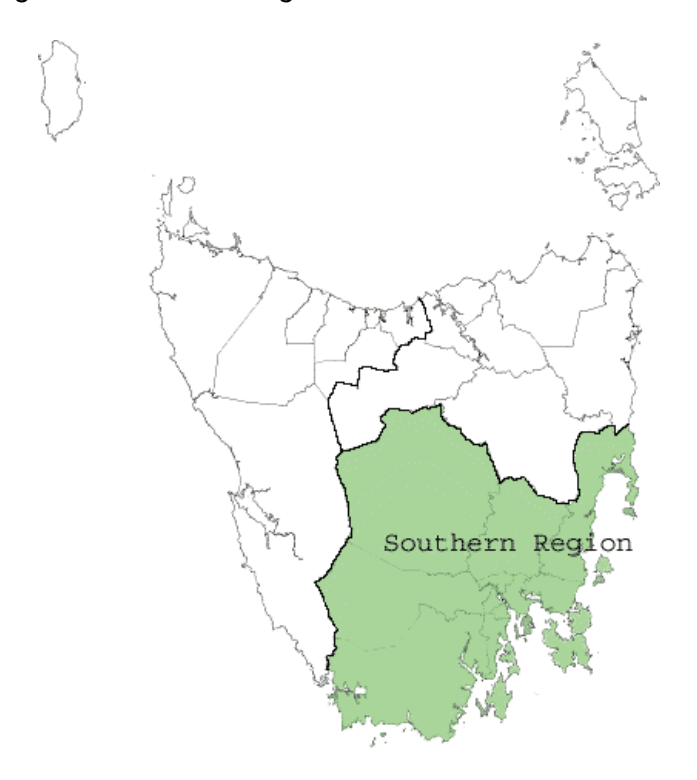
Figure 1: Southern Region